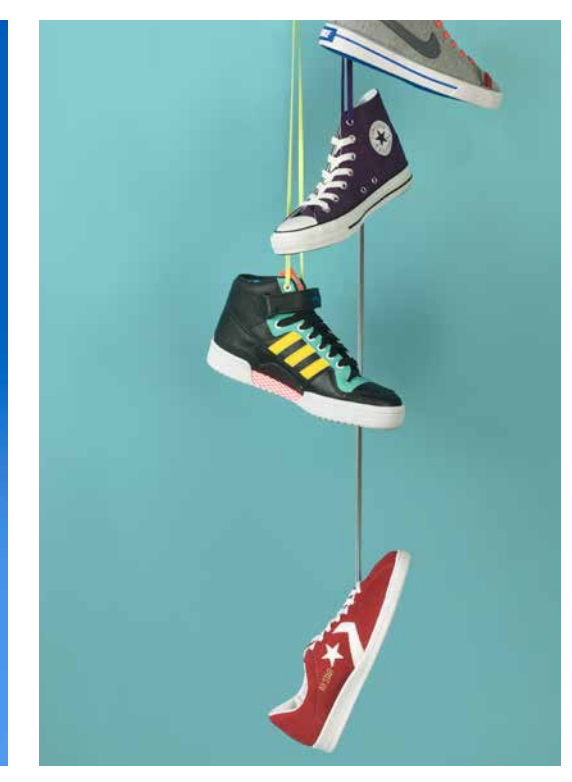
Principles and Practice of